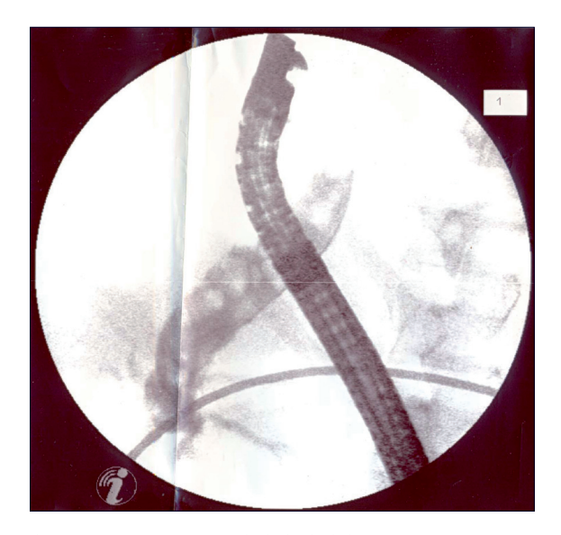
Fig. 2. ERCP image demonstrating recurrent choledocholithiasis

basket was performed, which allowed an evacuation of other stones with diameters exceeding 1 cm and numerous smaller stones. In order to protect the patient from the recurrence of bile ducts obstruction, an 8.5 F Oasis prosthesis of 5 cm was placed. During hospitalization, the patient developed iatrogenic acute pancreatitis; 6 months later, the patient underwent another endoscopic revision of the bile ducts. During that procedure the prosthesis was removed, ES was performed, obtaining a free outflow of a large number of asymptomatic stones, and dilated bile ducts were controlled with a balloon. After 1.5 years, following the last ERCP examination, the patient was hospitalized once again showing symptoms of recurrent choledocholithiasis. A heightened activity of hepatic enzymes was then detected. ERCP revealed significantly dilated bile ducts (up to 3 cm), with numerous soft stones up to 2 cm in diameter (Fig. 2). The papilla of Vater was incised again and these stones were evacuated. This examination led to complications involving another iatrogenic acute pancreatitis.